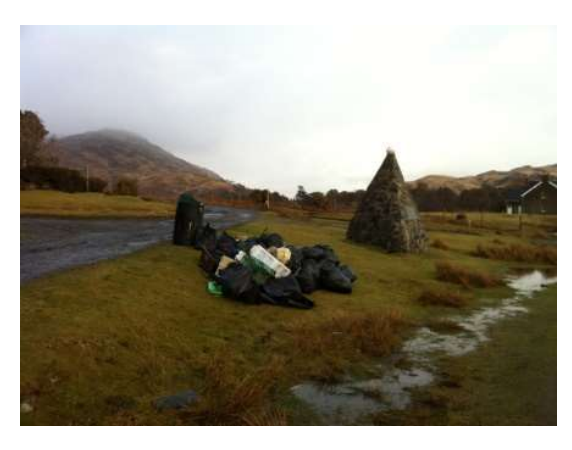
Rubbish Collected at Lochbuie

3 Beachwatch Surveys. The Marine Conservation Society need volunteers to survey what marine litter is found on UK beaches. The data collected through their Beachwatch scheme, (the UK's biggest survey of this kind) is important to change the hearts and minds of politicians and industry so that litter can be reduced. Until 2016, nowhere on Mull had been surveyed for a while, so 3 surveys is a great start. You only need to record what you pick up for a 100m stretch and it is quite easy to do. Please consider doing it, but if you would like someone to join you and do the data recording let us know – we can probably help.